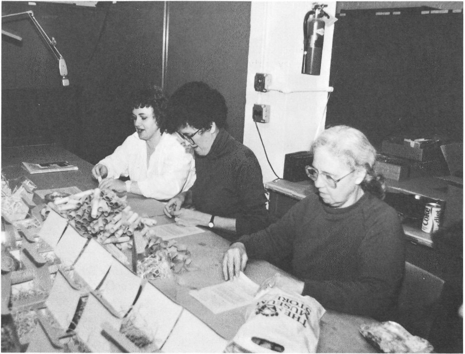
• Volunteers packing the ushebtis.