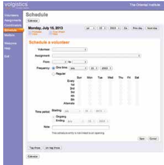
Figure 19. Screenshot of Volgistics

This year, from our new group of volunteers, six were selected to become docents and train to give tours. Docent captains continue to play an active role in guiding and training new docents, giving them the support they need