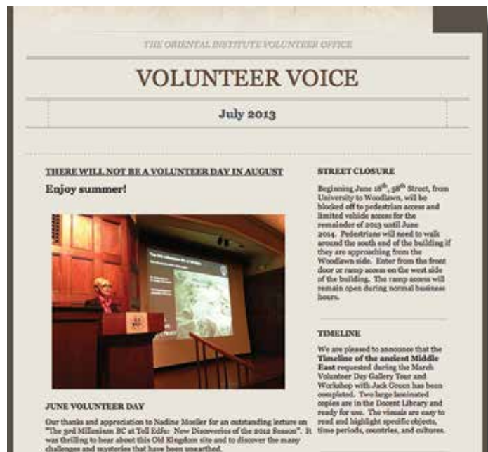
Figure 20. Screenshot of the online Volunteer Voice