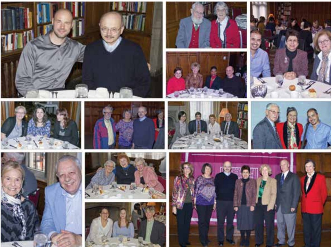
Figure 25. On December 3, faculty, staff, and volunteers gathered together to enjoy the annual volunteer luncheon at the University of Chicago Quadrangle Club to celebrate the year's achievements